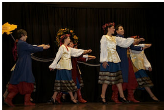
Deviatka - Elementary