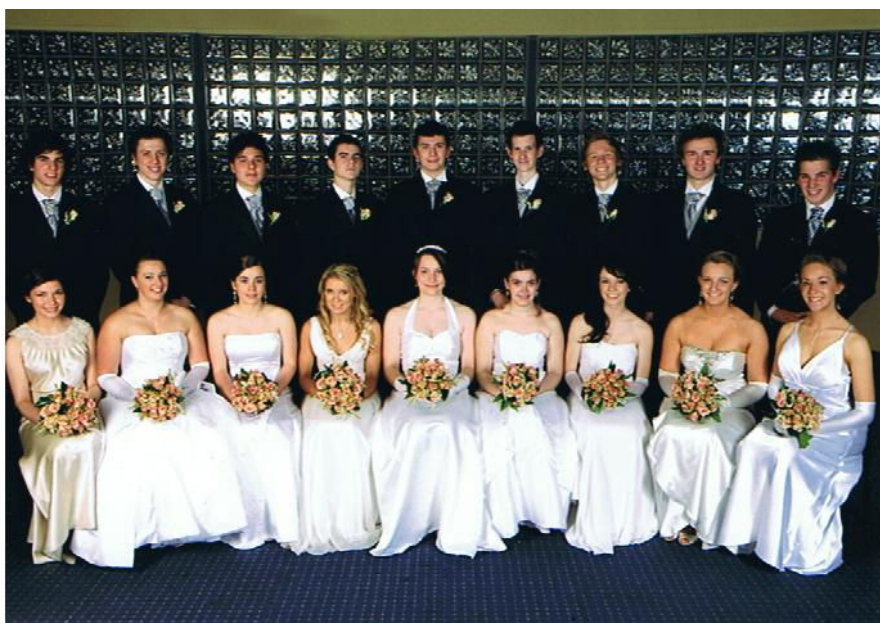
Debutantes 2009 from the following royi: