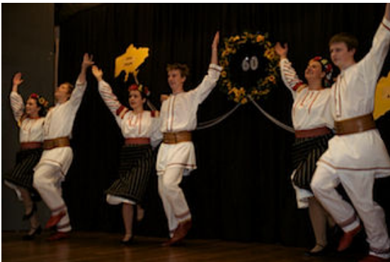
Bukovinian Wedding Dance - Intermediates

The Intermediate and Elementary dance groups performed at the Festival which took place at the Ardeer Ukrainian Hall on Sunday, 25 th October 2009. Displays and items for purchase were positioned around the hall including crafts, books and traditional foods. Verchovyna performed to a crowded audience as people in their masses came to commemorate this special anniversary.